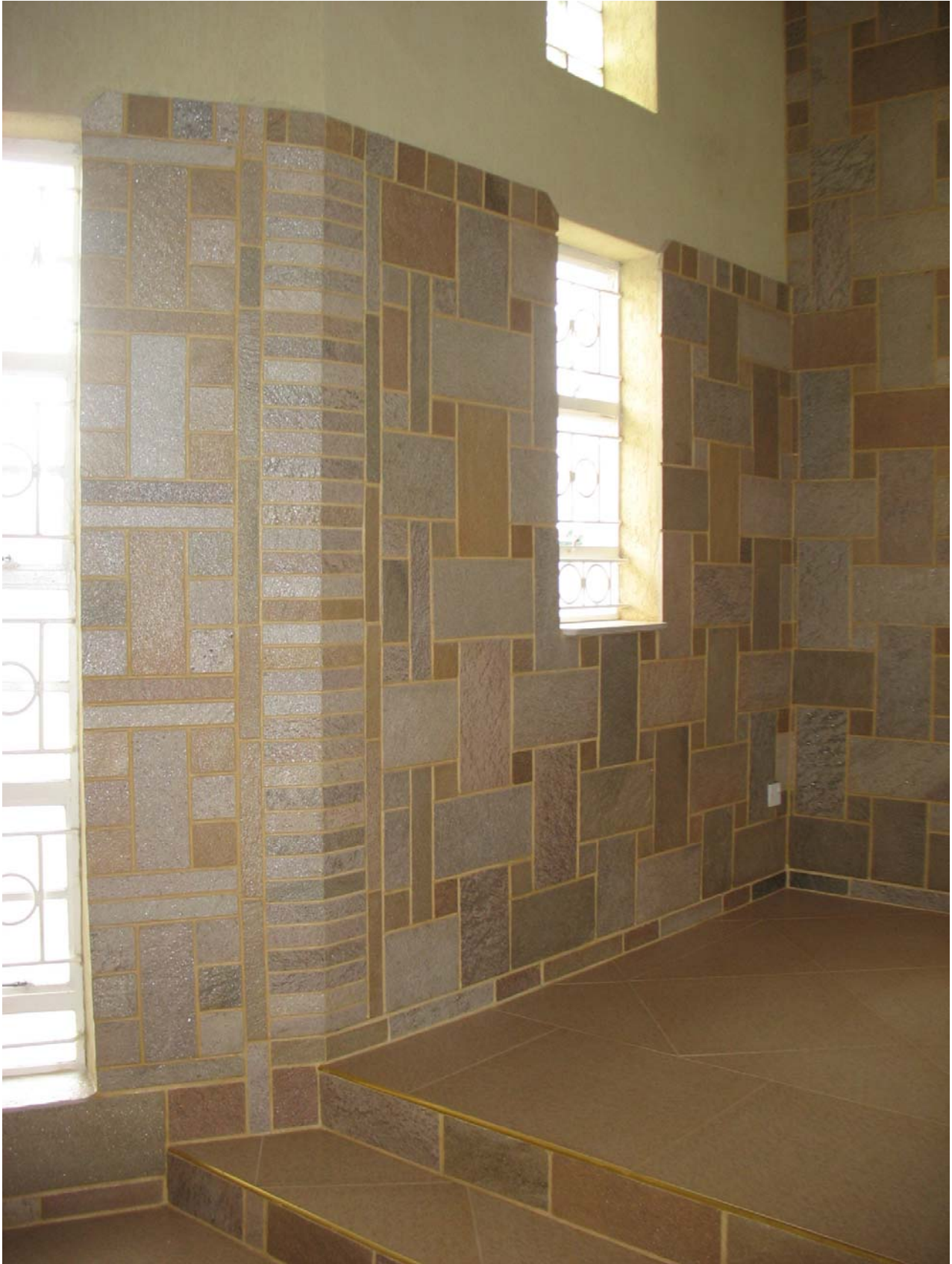
Stone finish completed