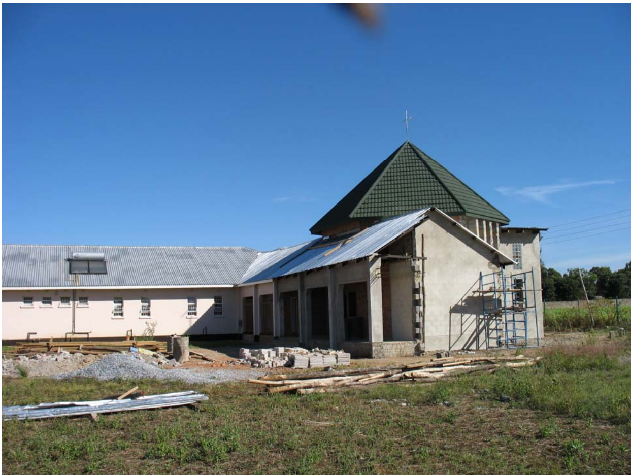
Exterior of the Chapel completed