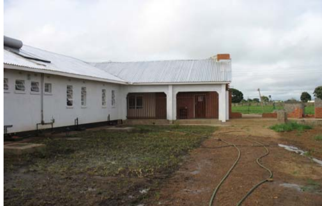
View of the house with the space for the future chapel

The originally planned shape was altered by addition of the space for the sanctuary bringing the floor surface of the chapel to the total of 65m 2 .