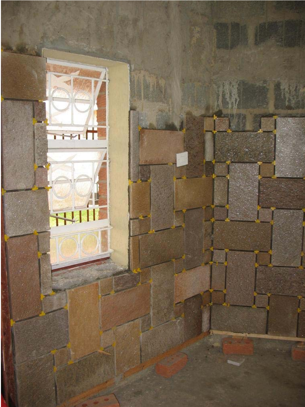
Fitting of stones

After research for locally available resources and materials a natural stone finish was chosen for the lower part of the wall and the sanctuary while an adhesive - based Graffiato plaster would be used for the upper part.